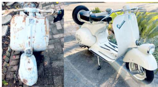
Danie Smit se gerestoureerde 1957 Fenderlight

"Daar is 'n ou wêreldse sjarme daarin om teen 'n rustiger pas ons pragtige area te verken" reken van die Vespa Klublede. Die Vespa motorfietse is eenvoudig en betroubaar en herstelwerk langs die pad is gewoonlik klein en maklik. Die nuwer generasie Vespas is meer gewild onder die dames. Die fietse is toegerus met vierslag-enjins en outomatiese ratkaste, wat hulle maklik maak om te ry. In 'n neutedop, die Vespa is nie net 'n motorfiets nie, dit is 'n leefstyl. Dit verbind mense, bespaar brandstof, en maak verkeer 'n ding van die verlede. So, as jy ooit oorweeg om 'n Vespa aan te skaf, onthou: dit is nie net 'n rit nie, dit is 'n avontuur!