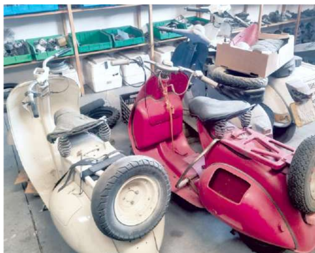
Vespas in veskillende fases van herstel.